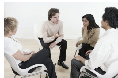
Coping with Prostate Cancer

Will take place on Tuesday, March 25th. At this meeting we will be having a group discussion about "Coping with Prostate Cancer". Facing a prostate cancer diagnosis can be overwhelming. Your stress levels may skyrocket. You may worry about a number of issues. With education and supportive care, you will be able to deal with many issues and emotions you're facing. The most important step you can take is to seek help as soon as you are having trouble coping. Taking action early will enable you to understand and deal with the many effects of the disease. We will be discussing some tips and resources available. You will be invited to share approaches you have discovered with others. And you will gain strength in knowing that you are not facing hardships alone. We hope you will join us in these discussions.